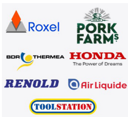
Manufacturing & Construction

No matter the industry, Digital Space is committed to delivering tailored Microsoft Azure Cloud solutions and services that drive results and empower your business to thrive in the digital age. Here is a snapshot of the main industries we have delivered for: